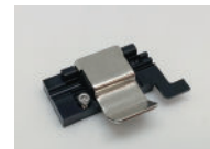
Single Fiber Adapter