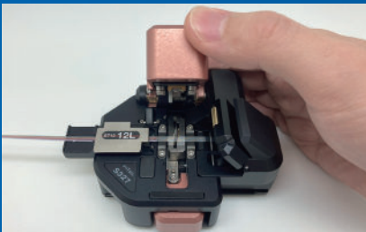
Operation by placing on your desk