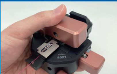
Operation by holding in one hand