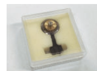
Blade Exchange Set (Optional component)

FURUKAWA ELECTRIC CO., LTD. https://www.furukawa.co.jp/en/