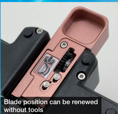
Blade position can be renewed without tools